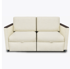
Number of Seats

Choose from 2 front panel styles – Upholstered or Laminated.