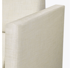
Optional Upholstered Arms

Advanced mechanism provides smooth and effortless functionality.