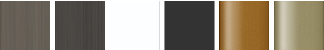
Graphite Walnut (Protea™) Charcoal Oak (Protea™) Premium White (Protea™) Premium Black (Classic) Premium Pure Copper (Classic) Premium Soft Gold (Classic)