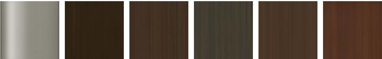
Premium Platinum (Classic) Espresso (Protea™) Golden Ebony (Protea™) Silver Ash (Protea™) Light Walnut (Protea™) Medium Cherry (Protea™)