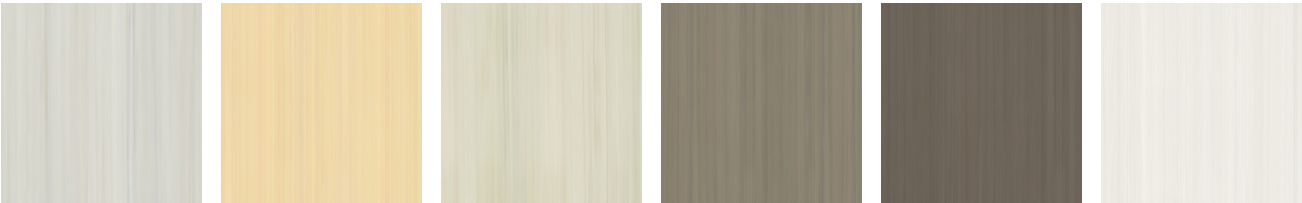
Sand Ash (Protea™) Natural Maple (Protea™) Natural Ash (Protea™) Medium Oak (Protea™) Medium Ash (Protea™) Grey Ash (Protea™)