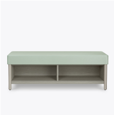
Optional Sliding Door

Protea™ Fusion doesn't have any of the drawbacks of wood. The finish is moisture impervious, easy to clean, and maintenance-free.