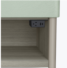
Optional Under Mount Power Module

The Bench is available as a 36", 42", 48" and 54" width model.