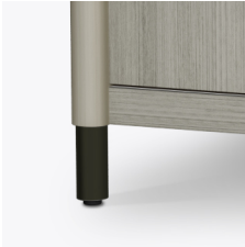
Optional Premium Protea Leg

The Ethan Bench is available with or without an optional sliding door.