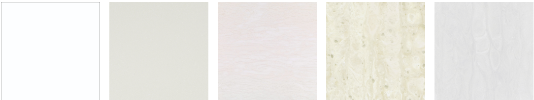
Snow White (SolidTops)