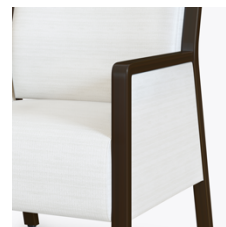
Optional Closed Arm Panels

Choose from 3 seat styles – lounge chair, love seat, and sofa.