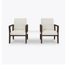
Other Table Styles

The linking table is available in a curved shape to better fit a curved space and is optional.