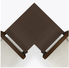
Optional Kwalu Top

Available with a 1.25" Top made of Kwalu's proprietary material.