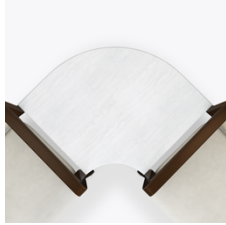
Optional Curved Shape

Available with a 1.25" Top made of Kwalu's proprietary material.