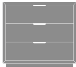
Nashville Chest, 3 Drawers Moasdfadel: NSVCH30 36W 20D 32H