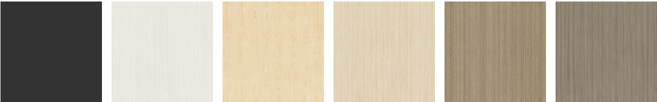
Premium Black (Protea™ Fusion) Sand Ash (Protea™ Fusion) Natural Maple (Protea™ Fusion) Natural Ash (Protea™ Fusion) Medium Oak (Protea™ Fusion) Medium Ash (Protea™ Fusion)