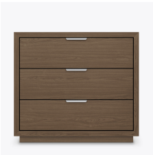
Other Chest Styles

Choose a contrasting plinth base, available exclusively in Premium Black, to elevate the overall aesthetic of the space.