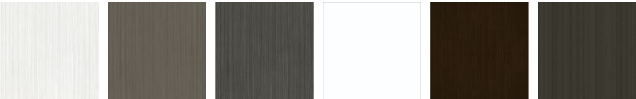
Grey Ash (Protea™ Fusion) Graphite Walnut (Protea™ Fusion) Charcoal Oak (Protea™ Fusion) Premium White (Protea™ Fusion) Espresso (Protea™ Fusion) Silver Ash (Protea™ Fusion)