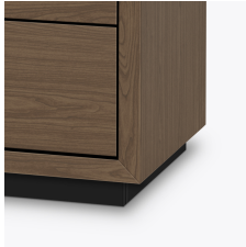
Optional Contrasting Plinth Base

Edge pulls, designed exclusively for the Nashville Collection, are available in a matte black, gold, and satin nickel finish.