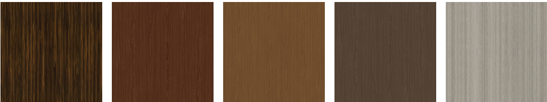
Golden Ebony (Protea™ Fusion) Medium Cherry (Protea™ Fusion) Patagonian Cherry (Protea™ Fusion) Light Walnut (Protea™ Fusion) Weathered Teak (Protea™ Fusion)