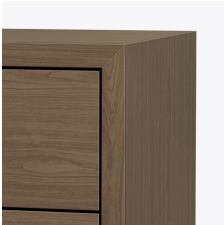
Mitered Edge Frame

The kit and instructions for wall mounting are included with this product. The wall mount instructions provided must be followed carefully for a secure, durable, and long-lasting solution to ensure the safety of the unit and the user.