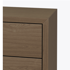
Mitered Edge Frame

The kit and instructions for wall mounting are included with this product. The wall mount instructions provided must be followed carefully for a secure, durable, and long-lasting solution to ensure the safety of the unit and the user.