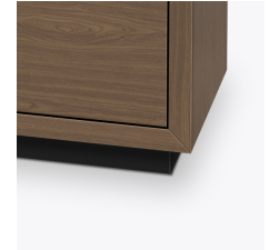
Optional Contrasting Plinth Base

Edge pulls, designed exclusively for the Nashville Collection, are available in a matte black, gold, and satin nickel finish.