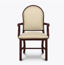
Optional Back Style

Choose from a variety of optional arm styles.