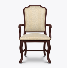
Optional Leg Style

Camel and oval back styles are available and optional.