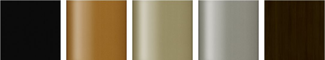
Premium Black (Classic) Premium Pure Copper (Classic) Premium Soft Gold (Classic) Premium Platinum (Classic) Blackwood (Classic)