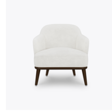
Number of Seats

Optional piping available on arms, back and seat only.