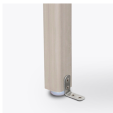
Optional Floor Mounting

Our patented steel-reinforced joint system uses over 20 pieces of steel in most Kwalu chairs. Stop ongoing and costly furniture replacement.