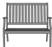
Arezzo Bench No Cushions Moasdfadel: AREBNC 47W 24.5D 40H 26AH