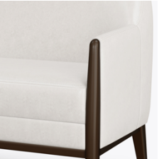
Optional Seat Construction

Available with piping around the base and arms. Not available for units with Non-Removable Seat Cushion.