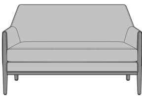
Bolsena Love Seat, with Piping Moasdfadel: BSNA211LS 54.5W 29.75D 34H 25AH