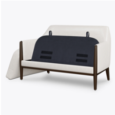
Removable Seat Deck

Our patented steel-reinforced joint system uses over 20 pieces of steel in most Kwalu chairs. Stop ongoing and costly furniture replacement.