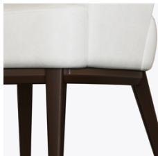
Contoured Seat Rails

Kwalu's solid surface (1/8" thick) proprietary finish doesn't have any of the drawbacks of wood. The frames are moisture impervious, graffiti-resistant, easy to clean and maintenance-free.