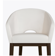
Optional Cutout on Back

An optional cutout on back is available to prevent buildup of debris and provide for easy maintenance.