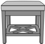
Loreto Ottoman, with X Cutout Detail Moasdfadel: LRTOTT1B1 20W 20D 19H