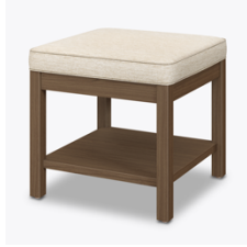
Optional Shelf Style

Kwalu's proprietary finish doesn't have any of the drawbacks of wood. The finish is moisture impervious, easy to clean and maintenance-free.