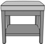
Loreto Ottoman, without X Cutout Detail Moasdfadel: LRTOTT1A1 20W 20D 19H