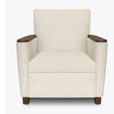
Optional Kwalu Legs

Raise and lower the footrest by pressing the 2 button control on the outside arm of the chair.