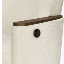
2 Button Control

Concealed cleanout eliminates a debris build-up behind the seat cushion.