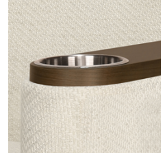
Optional Cup Holder

Optional tablet arm table supports a maximum of 100 lbs and may be mounted on either arm. Tablet cannot share an arm with 2 Button Control.