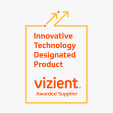
Vizient® Innovative Technology

Concealed cleanout eliminates a debris build-up behind the seat cushion.