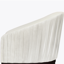
Optional Fabric Pleating Detail

Our patented steel-reinforced joint system uses over 20 pieces of steel in most Kwalu chairs. Stop ongoing and costly furniture replacement.