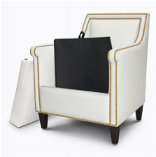
Removable Seat Deck

Extended arm creates easy to grasp handgrip.