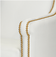
Easy to Grasp Handgrip

Kwalu's solid surface (1/8" thick) proprietary finish doesn't have any of the drawbacks of wood. The frames are moisture impervious, graffiti-resistant, easy to clean and maintenance-free.