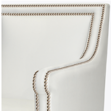
Optional Nail Head Finishes

Removable seat deck prevents buildup of debris and provides for easy maintenance.