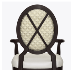
Optional Decorative Back

Optional casters available on front legs only.