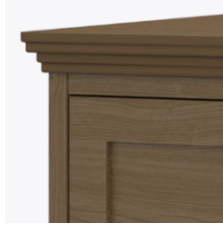
Reverse OG Edging on Top

The kit and instructions for wall mounting are included with this product. The wall mount instructions provided must be followed carefully for a secure, durable, and long-lasting solution to ensure the safety of the unit and the user.