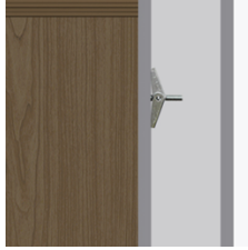
Wall Mount Hardware

Kwalu's proprietary finish doesn't have any of the drawbacks of wood. The finish is moisture impervious, easy to clean and maintenance-free.