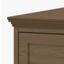
Reverse OG Edging on Top

The kit and instructions for wall mounting are included with this product. The wall mount instructions provided must be followed carefully for a secure, durable, and long-lasting solution to ensure the safety of the unit and the user.