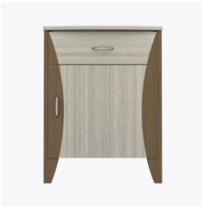
Other Bedside Styles

A top drawer lock is available and is optional.