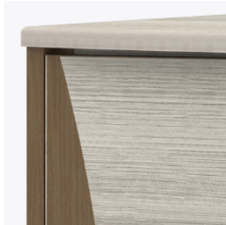
Waterfall Edging on Top

The kit and instructions for wall mounting are included with this product. The wall mount instructions provided must be followed carefully for a secure, durable, and long-lasting solution to ensure the safety of the unit and the user.