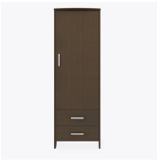
Other Wardrobe Styles

Choose from dozens of hardware styles, including ADA compliant options.