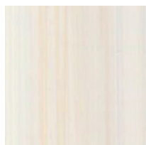
Wood Ash (Fusion)