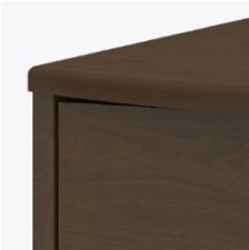
Waterfall Edging on Top

Kwalu's proprietary finish doesn't have any of the drawbacks of wood. The finish is moisture impervious, easy to clean and maintenance-free.