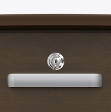
Optional Top Drawer Lock

Choose from dozens of hardware styles, including ADA compliant options.