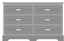
Dorchester Dresser, 6 Drawers Moasdfadel: DODR60 48.5W 19.25D 30.75H