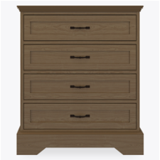
Other Chest Styles

Choose from dozens of hardware styles, including ADA compliant options.