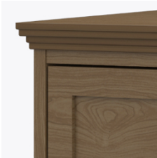
Reverse OG Edging on Top

The kit and instructions for wall mounting are included with this product. The wall mount instructions provided must be followed carefully for a secure, durable, and long-lasting solution to ensure the safety of the unit and the user.