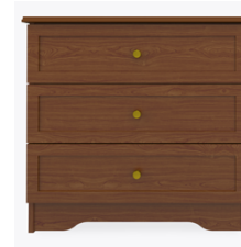
Optional Wider Version

Are constructed with both dowel and mechanical fasteners for additional strength. 100lb static and dynamic load Euro Drawer Slides allow for easy opening and closing.