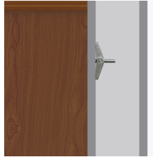
Wall Mount Hardware

Kwalu's proprietary finish doesn't have any of the drawbacks of wood. The finish is moisture impervious, easy to clean and maintenance-free.