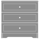
Lancaster Chest Wide, 3 Drawers Moasfadel: LACH30W 31.5W 19D 30H