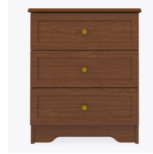
Optional Narrower Version

Are constructed with both dowel and mechanical fasteners for additional strength. 100lb static and dynamic load Euro Drawer Slides allow for easy opening and closing.