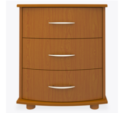
Other Chest Styles

Are constructed with both dowel and mechanical fasteners for additional strength. Ball bearing removable slides are fully extendable.