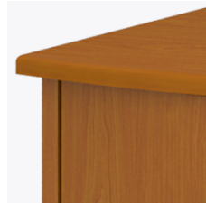
Waterfall Edging on Top

The graceful curved front is a signature Camelot feature.