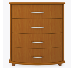
Other Chest Styles

Are constructed with both dowel and mechanical fasteners for additional strength. Ball bearing removable slides are fully extendable.