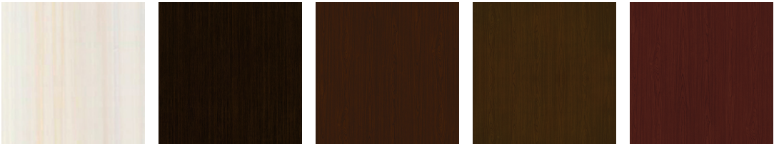
Wood Ash (Fusion) Midnight Oak (Fusion) Natural Mahogany (Fusion) Espresso (Fusion) African Mahogany (Fusion)