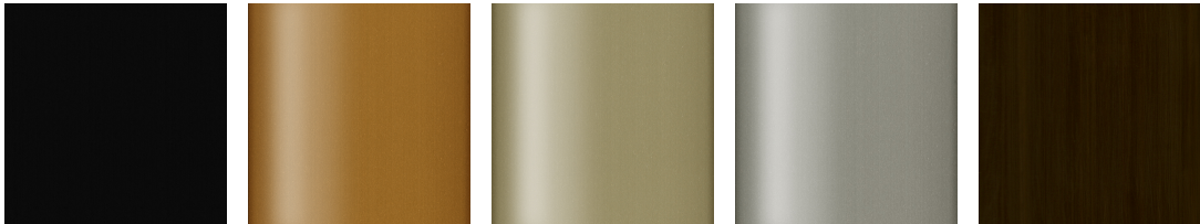
Premium Black (Classic) Premium Pure Copper (Classic) Premium Soft Gold (Classic) Premium Platinum (Classic) Blackwood (Classic)