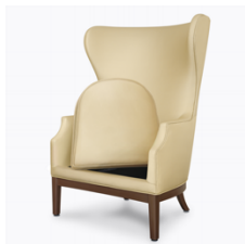
Removable Seat Cushion

Our patented steel-reinforced joint system uses over 20 pieces of steel in most Kwalu chairs. Stop ongoing and costly furniture replacement.