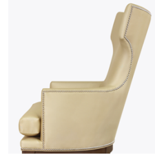
Optional Nail Head Trim

Concealed cleanout eliminates a debris build-up behind the seat cushion.