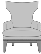
Vizzini Wing Back Lounge Chair, Nail Head Detail Arms, Back, & Base Moasdfadel: VIZ11 32W 32D 44H 25AH