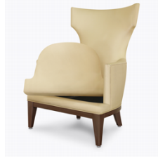
Removable Seat Cushion

Our patented steel-reinforced joint system uses over 20 pieces of steel in most Kwalu chairs. Stop ongoing and costly furniture replacement.