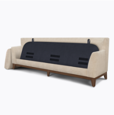
Removable Seat Deck

Back available with or without optional button detail.