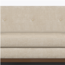
Optional Back Button

Kwalu's solid surface (1/8" thick) proprietary finish doesn't have any of the drawbacks of wood. The frames are moisture impervious, graffiti-resistant, easy to clean and maintenance-free.