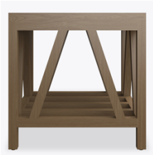
Other Table Styles

Kwalu's proprietary finish doesn't have any of the drawbacks of wood. The finish is moisture impervious, easy to clean and maintenance-free.