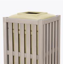
Optional Liner Color

Available with top load or optional side load lids.