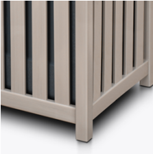
Waterproof Outdoor UV Protected Frame

Special additive protects frame against the elements and damaging ultraviolet rays.