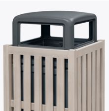
Optional Lid Style

Special additive protects frame against the elements and damaging ultraviolet rays.