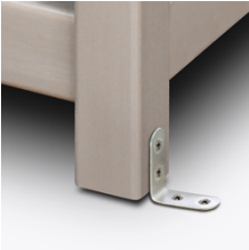
Optional Floor Mounting

42 gallon liner in grey is provided. The liner in beige is optional.