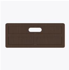
Optional Router Out for Control Panels

Optional factory pre-drilling is available. Template must be provided by customer when this feature is selected.