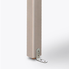
Optional Floor Mounting

Optional swivel casters may be added to the left side of the table only.