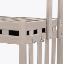
Waterproof Outdoor UV Protected Frame

Special additive protects frame against the elements and damaging ultraviolet rays.