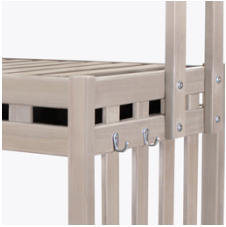
Waterproof Outdoor UV Protected Frame

Special additive protects frame against the elements and damaging ultraviolet rays.