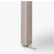
Optional Floor Mounting

Optional swivel casters may be added to the left side of the table only.