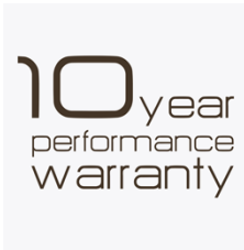
10 Year Warranty

Optional factory pre-drilling is available. Template must be provided by customer when this feature is selected.