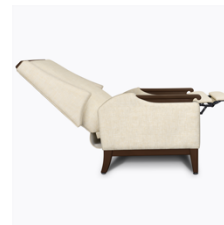
Three Position Recliner

Concealed cleanout eliminates a debris build-up behind the seat cushion.