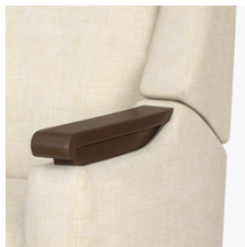
Easy to Grasp Handgrip

Our patented steel-reinforced joint system uses over 20 pieces of steel in most Kwalu chairs. Stop ongoing and costly furniture replacement.