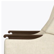
Push on the Arms Mechanism

Extended arm creates easy to grasp handgrip.