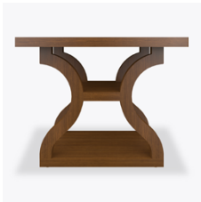
Other Table Styles

Kwalu's proprietary finish doesn't have any of the drawbacks of wood. The finish is moisture impervious, easy to clean and maintenance-free.