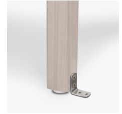
Optional Floor Mounting

Please contact a sales associate to purchase additional or replacement cushions.