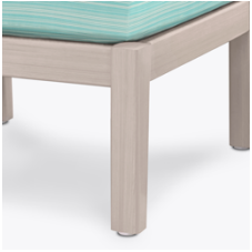
Waterproof Outdoor UV Protected Frame

Special additive protects frame against the elements and damaging ultraviolet rays.