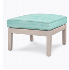
Optional Piping on Seat

Kwalu's quick drying cushion construction moves moisture through fast allowing cushions and pillows to dry rapidly.