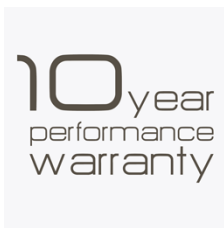
10 Year Warranty

Atlanta II chest styles include 3, 4, 5 and 6 drawer versions.