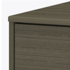
Waterfall Edging on Top

The kit and instructions for wall mounting are included with this product. The wall mount instructions provided must be followed carefully for a secure, durable, and long-lasting solution to ensure the safety of the unit and the user.