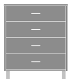
Atlanta II Chest Wide, 4 Drawers Moasdfadel: A2CH40W 31.75W 18.5D 37H