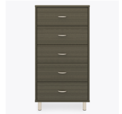
Other Chest Styles

Raised on rust proof aluminum feet to allow ease of cleaning beneath casework.