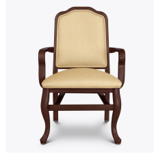
Optional Back Style

Choose from a variety of optional arm styles.