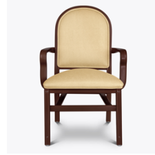
Optional Leg Style

Camel and oval back styles are available and optional.