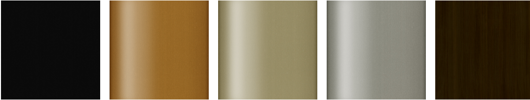
Premium Black (Classic)