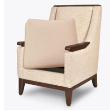
Removable Seat Cushion

Concealed cleanout eliminates a debris build-up behind the seat cushion.