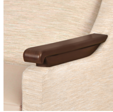
Easy to Grasp Handgrip

Our patented steel-reinforced joint system uses over 20 pieces of steel in most Kwalu chairs. Stop ongoing and costly furniture replacement.