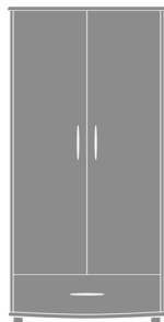
Camelot Double Wardrobe, 1 Drawer, 2 Doors Moasdfadel: CAWR12 34.75W 25D 70.5H