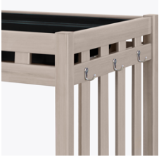
Waterproof Outdoor UV Protected Frame

Special additive protects frame against the elements and damaging ultraviolet rays.