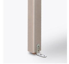
Optional Floor Mounting

Optional swivel casters may be added to the left side of the table only.