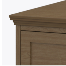
Reverse OG Edging on Top

The kit and instructions for wall mounting are included with this product. The wall mount instructions provided must be followed carefully for a secure, durable, and long-lasting solution to ensure the safety of the unit and the user.