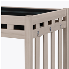
Waterproof Outdoor UV Protected Frame

Special additive protects frame against the elements and damaging ultraviolet rays.