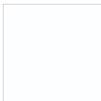
Outdoor White UV (Outdoor)