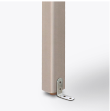
Optional Floor Mounting

Optional swivel casters may be added to the left side of the table only.